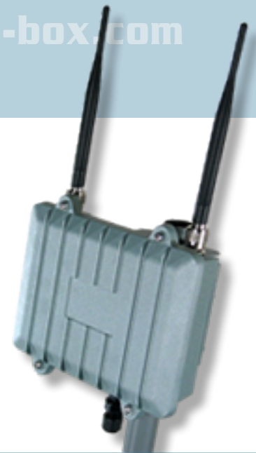
WRAP-BOX 2A1E on 1" mast