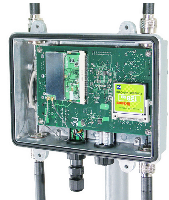
Inside the WRAP-BOX 4A2E