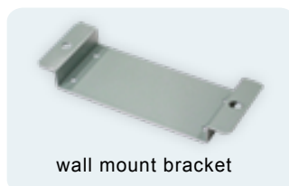
wall mount bracket

Corporate address: 43230 Christy St, Fremont, CA http://www.mini-box.com, email: sales@ituner.com